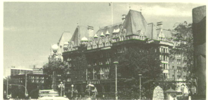
The Empress Hotel sits by the inner harbor of Victoria, British Columbia.

After a hectic week at the 1988 Annual CNS Meeting in Seattle, plan to unwind and relax at the Post Convention Meeting to be held in Victoria, British Columbia, Canada. This trip has been designed specifically for relaxation and enjoyment in combination with a stimulating scientific program. Barbara and Brian Hunt have gone to great effort to make this Post Convention Meeting both convenient and enjoyable. The meeting will be held at the majestic Empress Hotel located on the inner harbor. This grand hotel has been in operation for over 75 years. Often referred to as "Little England," Victoria offers old world charm, quaint shops, and excellent dining. Arrangements have been made for the Post Convention group to depart Seattle at 2:00 p.m. on Thursday, September 29, 1988, via the Victoria Clipper. This highspeed catamaran has been chartered specifically for our group and will arrive in Victoria in 2½ hours for an enjoyable weekend stay in this lovely city. The return trip is scheduled for Sunday, October 2, 1988, via the Victoria Clipper. The Post Convention Meeting promises to be one of the most convenient that the CNS has been able to offer and the environment will provide just what we need at that time — relaxation! We hope to see you in Victoria following our Annual Meeting.