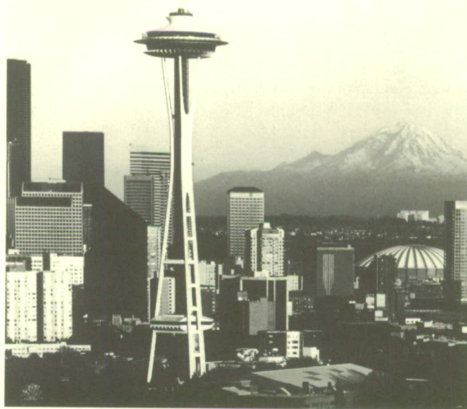
The Space Needle (foreground) in Seattle Center.

As you can see, Seattle is filled with surprises that offer you a wide variety of pleasurable pursuits from the usual to the unique, from the vigorous to the vicarious. The Emerald City is certainly a number one ranked site for our annual meeting.