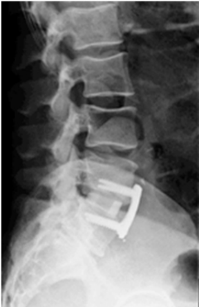
Figure 2, A and B