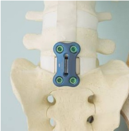
Figure 1, A and B