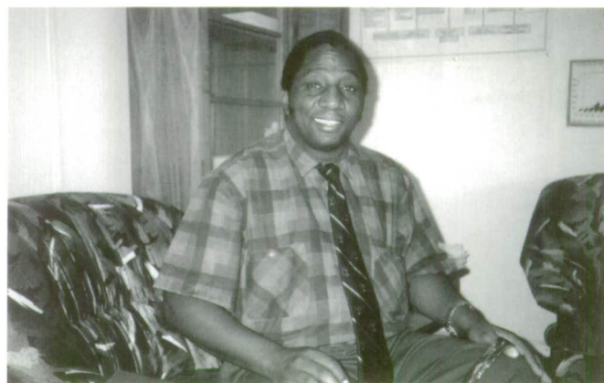
Dr. Dhaklama, Deputy Minister of Health, Zimbabwe, sartorially resplendent wearing the CNS tie.

This effort is aimed at enhancing neurosurgical capabilities at the University of Zimbabwe, building on the four decades of