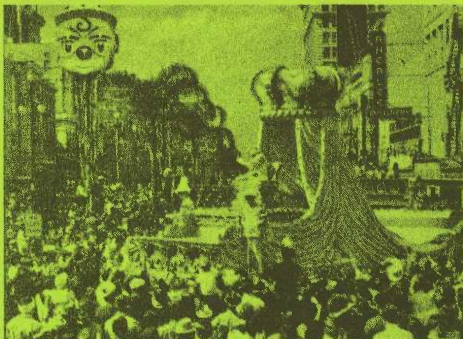
NEW ORLEANS - Home of the Mardi Gras and the 26th Annual CNS Meeting.